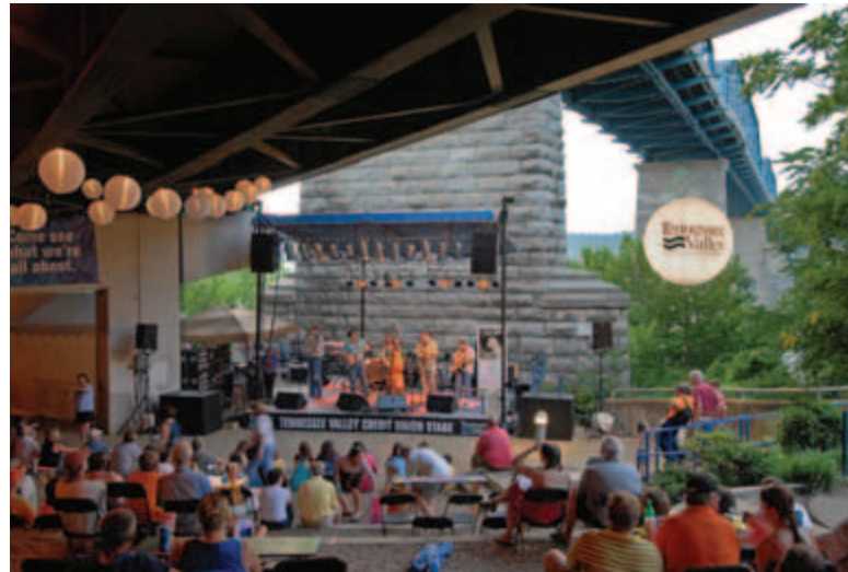
▲ TVFCU's Riverbend Stage, under the Walnut Street Bridge. ▶ Exterior view of one of TVFCU's newest branches.